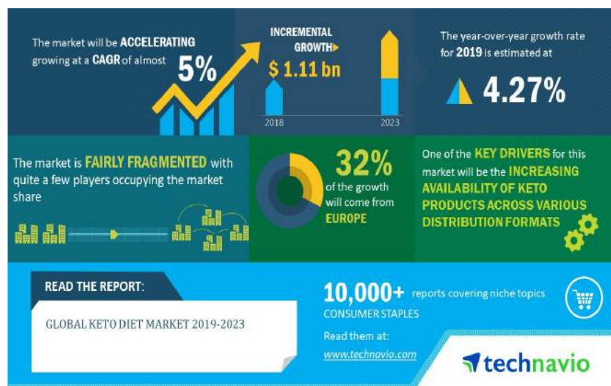
Figure 1. Global data of keto diet market source [13].

In another study, the effect of ketogenic-diet was observed on skeletal muscles. This study was conducted on two groups of young and old rats. The food was given to rats for almost 4 weeks and the calories of this food were increased gradually. It has been found that ketones level was increased in the blood in adult rats as compared to old rats. Similarly, mitochondrial respiration was increased